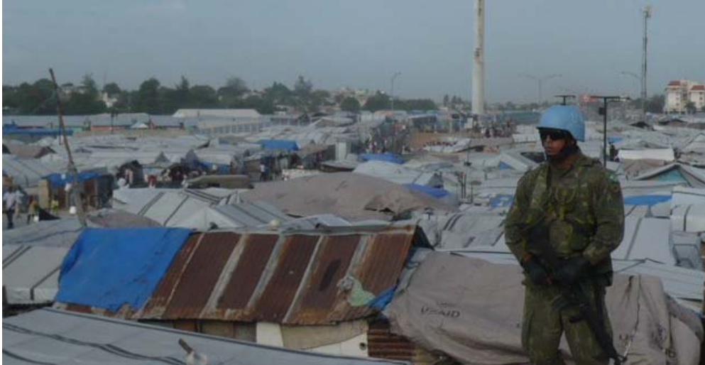
Camp Jean Marie Vincent, largest in Port-au-Prince.

This camp, like all the others we visited, has committees of delegated representatives to organize and oversee the delivery of services—food and water, schooling, sanitation, health care, etc. But the committees work in exceptionally difficult conditions because the basic necessities are in short supply or non-existent.