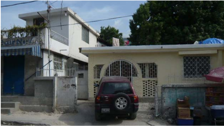
This house on the left is marked with a red code just above the street number “46”. It is extremely dangerous to inhabit.

houses despite communications and warnings from MTPTC engineers since they have nowhere to go but the camps.”