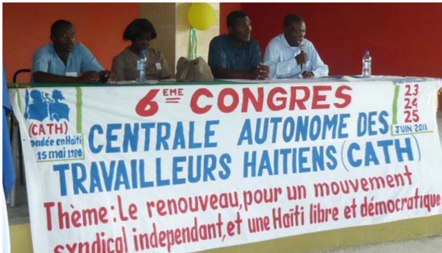
Convention of CATH union, June 23, 2011.

The convention discussed and voted on reports and resolutions to guide the work of the union in the coming months. These focused on the challenges and difficulties of the reconstruction process. Convention decisions stressed that principles of social justice and national sovereignty for Haitians must be at the center of plans for the country’s future.