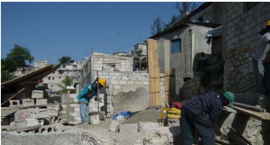
A home repair underway using the training and building guidelines taught by Build Change, June 22, 2011.

We encourage donors, architects and engineers in Canada to get to know this organization's work and support it. 15