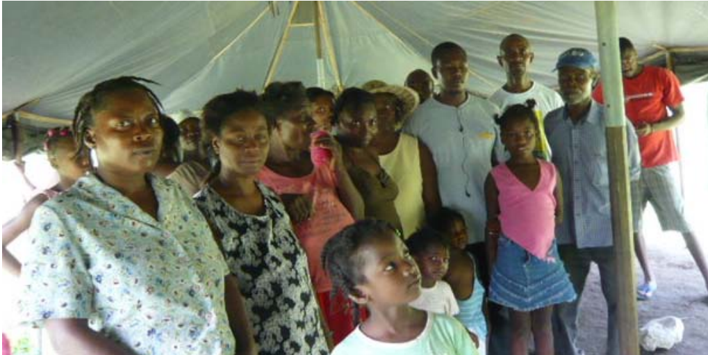
Residents of Camp Bolivar are angry that so little housing is being built.

We attended a press conference that dozens of residents of Camp Django (app. 100 families in Delmas 17, central Port-au-Prince) held at the office of the Bureau des avocats internationaux on June 28 to denounce threats to dismantle their camp coming from the office of the mayor of Delmas (more on the threats of forced dislocations from camps later in this report).