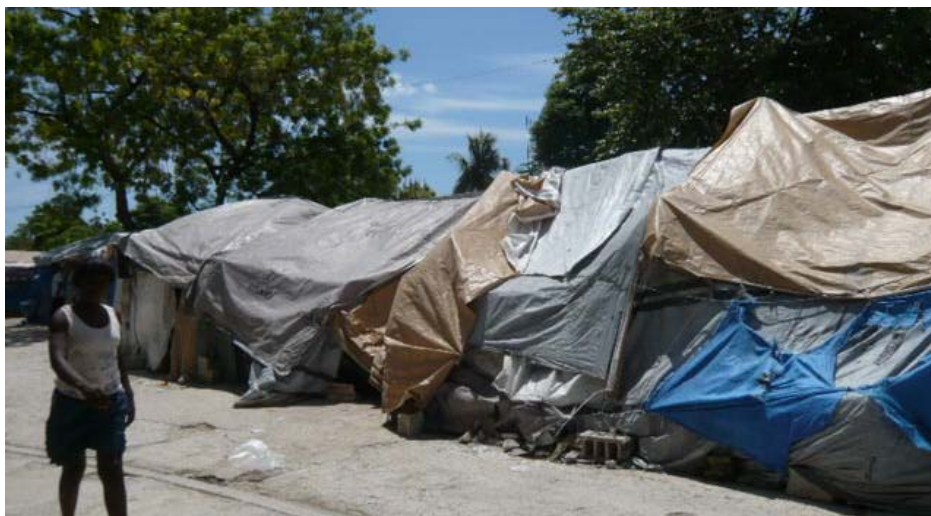
One of the 1,000 displaced persons camps in the earthquake zone.

Although efforts to develop a shelter and resettlement policy began in May 2010, it is still being debated because there is no government interlocutor at a technical or policy level who can sign off on an option. p 9